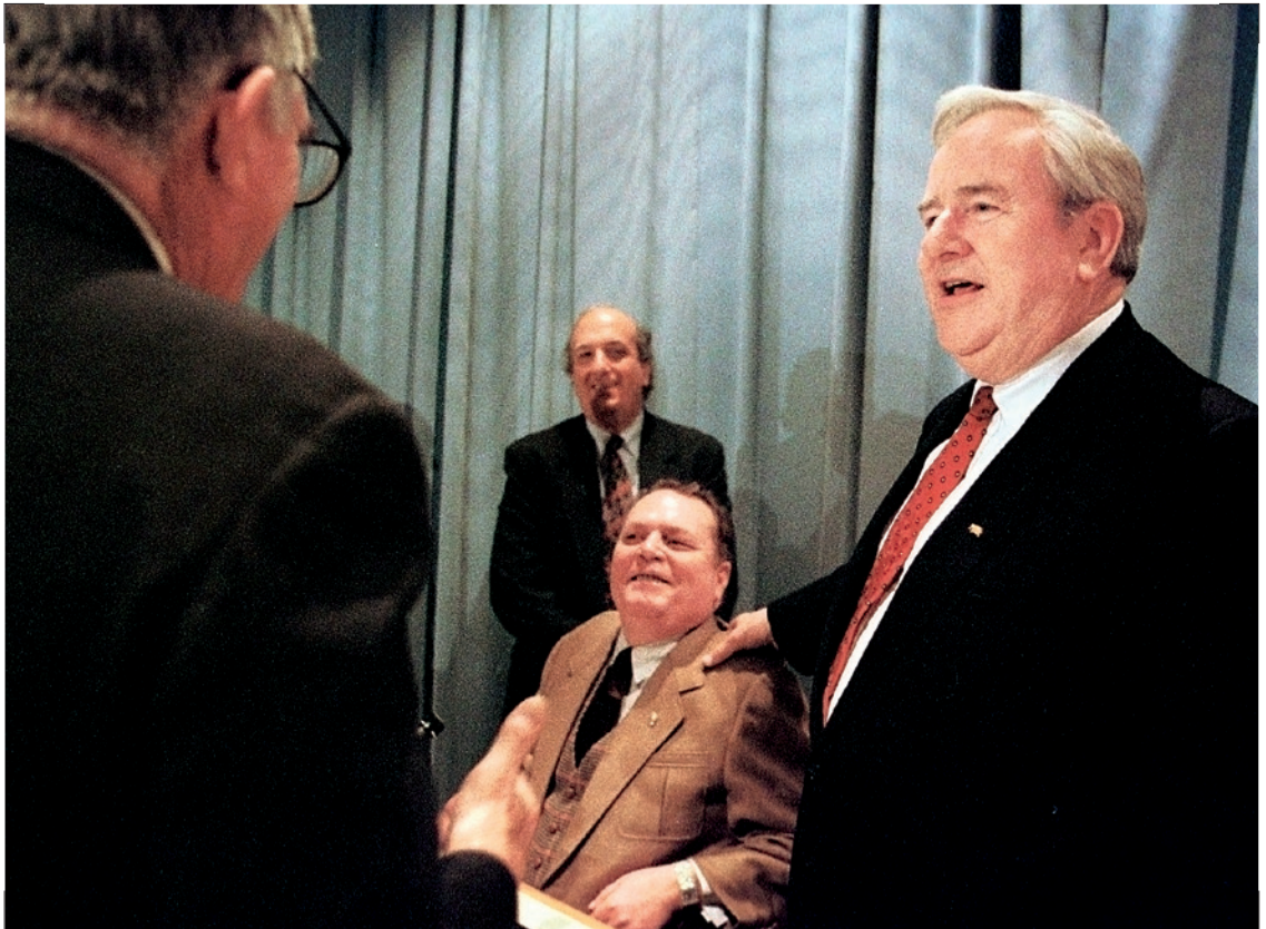
Above: After Hustler owner Larry Flynt, left, published a lewd parody of Virginia televangelist Rev. Jerry Falwell, right, Falwell sued Flynt for libel. The case reached the U.S. Supreme Court where Chief Justice William Rehnquist wrote that Falwell, as a public figure, must tolerate such attacks in order to give sufficient "breathing space" to the freedoms protected by the First Amendment.

Courts in the United States, however, were slow to recognize a right to privacy. Although the Supreme Court has interpreted the Fourth Amendment of the U.S. Constitution to protect individuals from unreasonable searches and seizures, as well as other unwar-