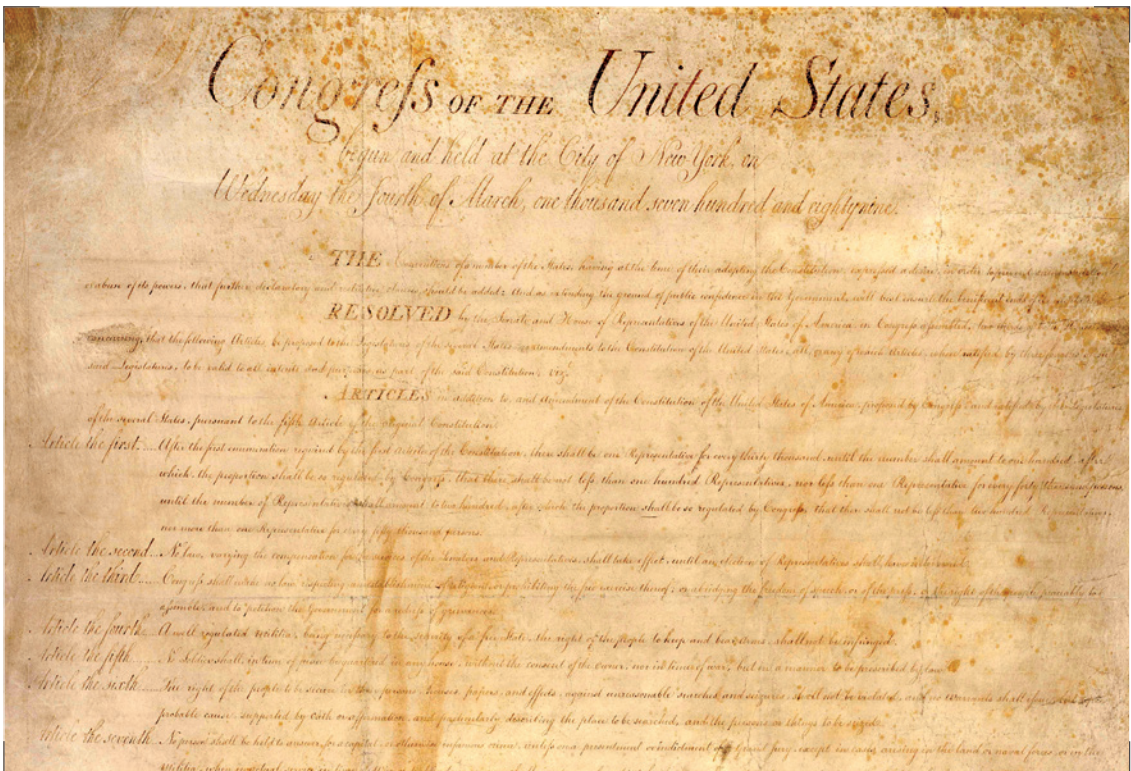
Above: Freedom of the press is explicitly protected under the First Amendment of the Bill of Rights in the U.S. Constitution.

The First Amendment to the United States Constitution, ratified in 1791, is similarly absolute: