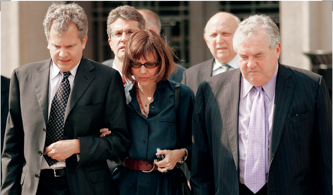
Above: New York Times reporter Judith Miller was jailed for contempt of court for refusing to reveal a confidential source. Miller, accompanied by her legal team, leave the U.S. District Court in Washington, DC, on June 29, 2005.

On the other hand, in March 2008, the United Nations Human Rights Council adopted a resolution condemning “defamation of religions.” And many