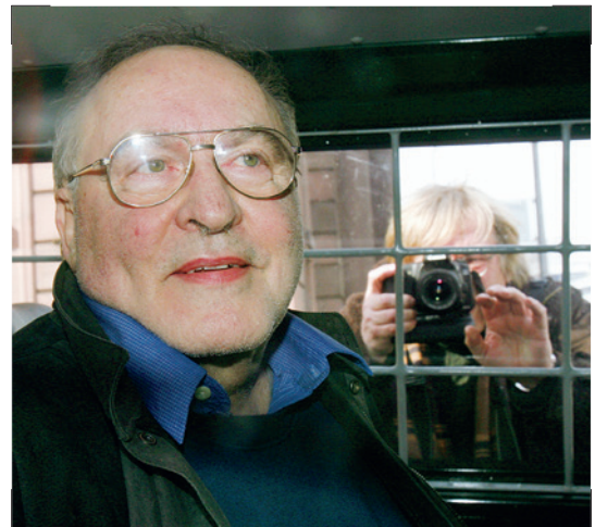
Above: Ernst Zündel, author of The Hitler We Love and Why and publisher of Did Six Million Really Die? , was handed the maximum allowable sentence under German law in 2007 for inciting hatred and denying the Holocaust. Holocaust denial is a specific criminal offense in several European countries.

Punishment may also await those who challenge the accepted wisdom concerning historical incidents. In Tur-