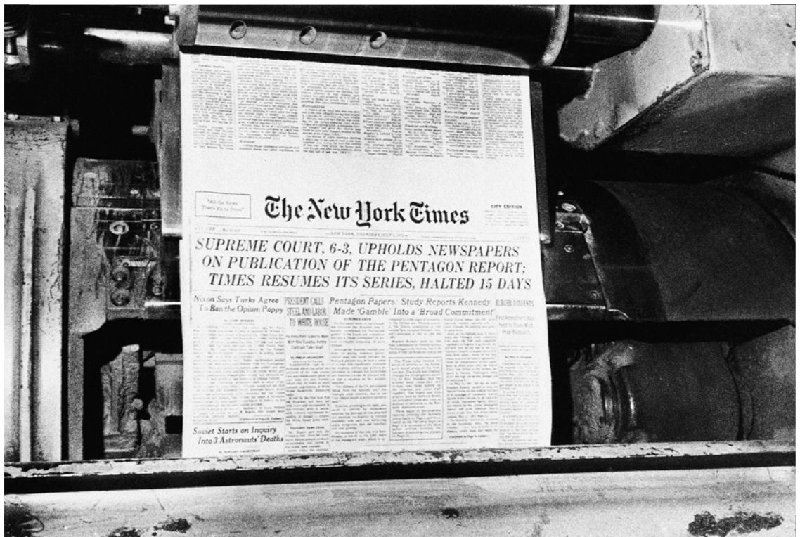
Above: In 1971, the New York Times published the Pentagon Papers despite government claims that doing so would endanger national security. The U.S. Supreme Court ruled that constitutional guarantees of a free press overrode other considerations, and allowed further publication.

Most journalism codes emphasize that telling the truth—being accurate—is essential. “Seek truth and report it” is the first core principle of the Society of Professional Journalists Code of Ethics. The British Editors’ Code of Practice also lists accuracy as its first principle and states, “The press must take care not to publish inaccurate, misleading or distorted information, including pictures.” The one universal ethical principle may