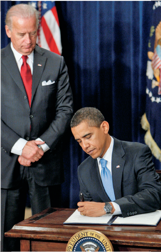
Above: U.S. President Barack Obama signed five executive orders on January 21, 2009, requiring staffers to comply with strict new rules on the Freedom of Information Act. In a memo released that day, President Obama wrote: "The Government should not keep information confidential merely because public officials might be embarrassed by disclosure, because errors and failures might be revealed, or because of speculative or abstract fears."

Although the United States does not have an official secrets act of the type found in many other countries, records properly classified in accordance with a presidential executive order can be withheld. In the post-9/11 environment, the practice of classifying information has increased in much of the world. This imposes new obstacles to citizens seeking both intelligence and law enforcement records. And as governments collect more personally identifiable information, agencies frequently invoke the privacy exemptions as grounds to withhold many government records. These exemptions are sometimes