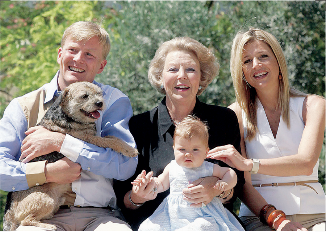
Above: Was privacy a more important right than freedom of the press? A court in Amsterdam ruled that the AP photographers violated the Dutch royal family's privacy by distributing photos taken of them during a skiing holiday in Argentina.