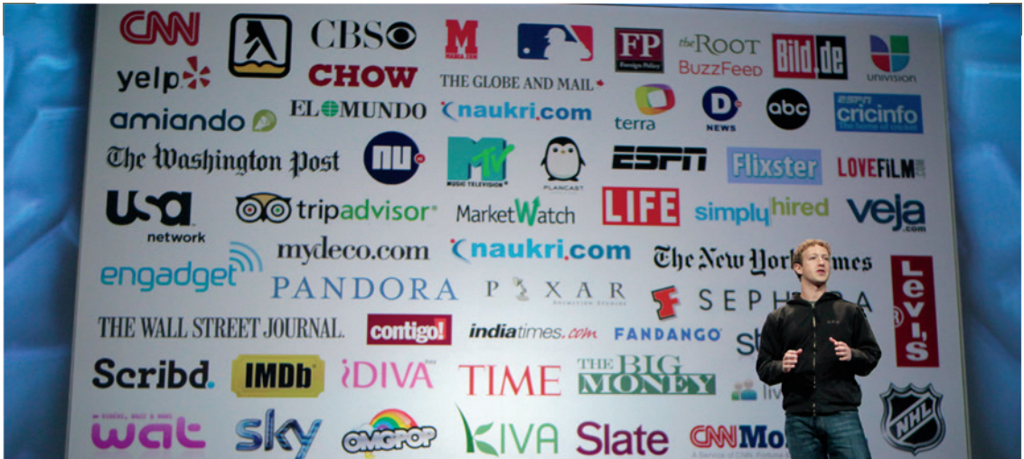
Above: Social media raises new questions for journalists. Facebook CEO Mark Zuckerberg delivered the keynote address at an internet conference in San Francisco on April 21, 2010.

But social media pose new challenges for the ethical journalist. Verifying postings can be difficult. Reporters should make clear when they utilize social media sites as the basis for a story. They should exercise special caution when using information concerning minors, which could damage someone's reputation, or when using information that someone else claims to own—such as a trade secret. The laws of libel, privacy, and copyright still apply in cyberspace.