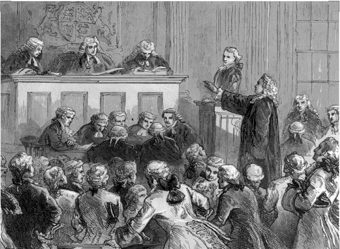
Above: Andrew Hamilton defended John Peter Zenger, publisher of the New York Weekly Journal , who was charged in 1735 with seditious libel for criticizing the Royal Governor. Hamilton argued the truth of Zenger's publication was a defense against seditious libel. The jury acquitted Zenger; an action Hamilton praised: "You have laid a noble foundation for securing to ourselves that to which Nature and the Laws of our country have given us a Right—The Liberty—both of exposing and opposing arbitrary power by speaking and writing Truth."

That absolute language was drafted by revolutionaries shortly after the American War of Independence (1775–1783), during a time of great optimism, but also of great uncertainty. The nation's courts have, over the two hundred-plus years that followed, interpreted the First Amendment as powerful, but perhaps not quite absolute.